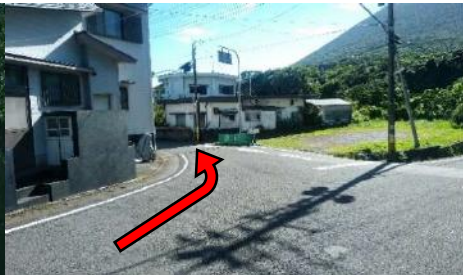
③ Do NOT cross this bridge.